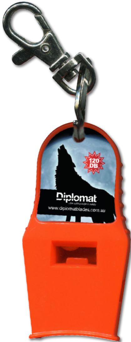
Code: RESCUE WHISTLE

Sound is the #1 factor in finding lost or trapped victims and preventing crime.